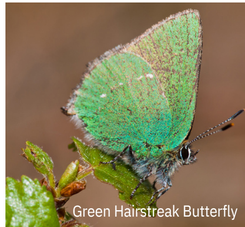
Green Hairstreak Butterfly