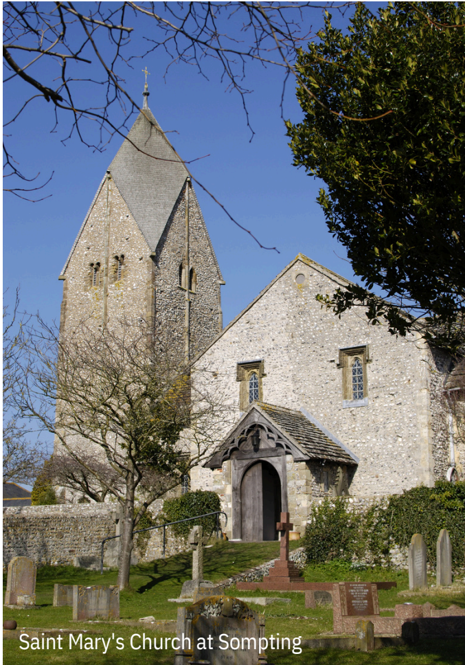
Saint Mary's Church at Sompting