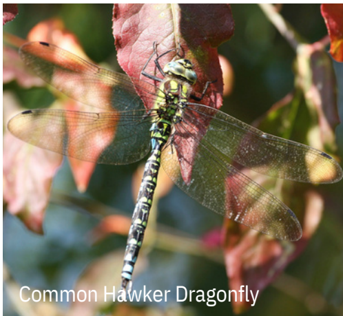
Common Hawker Dragonfly