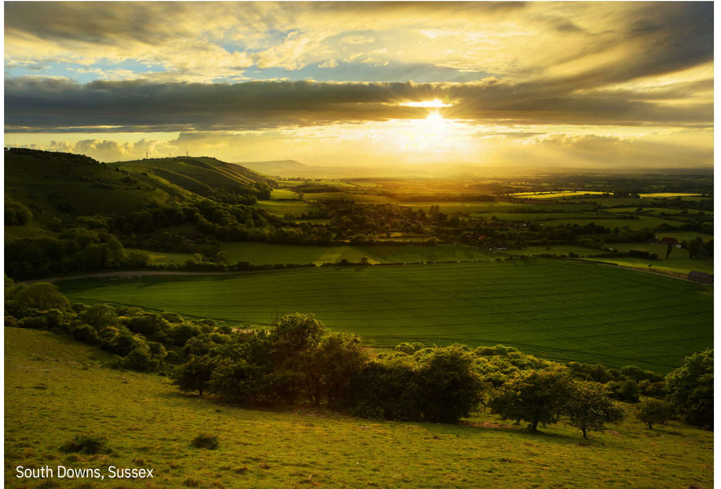
South Downs, Sussex